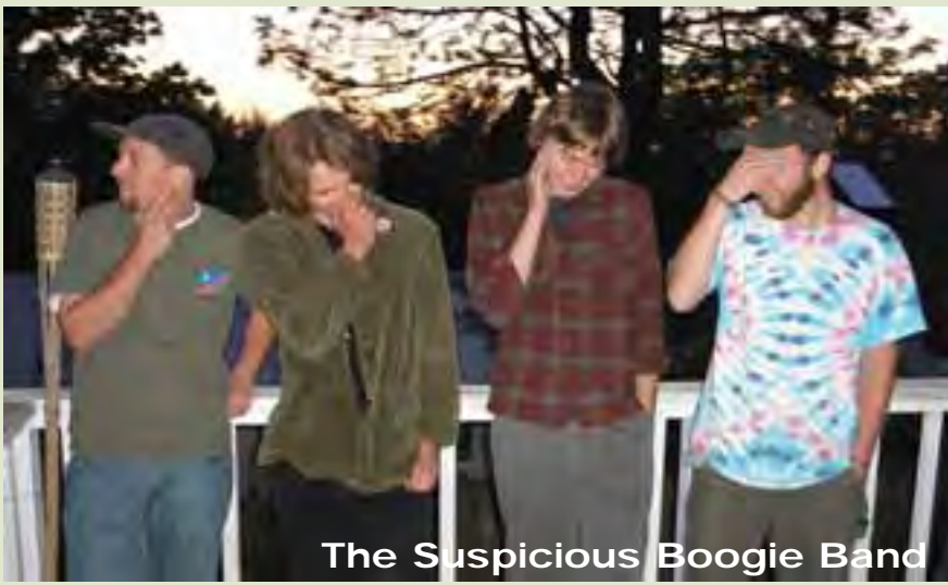
The Suspicious Boogie Band