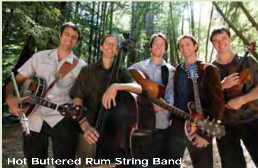
Hot Buttered Rum String Band

deliciously melody-driven songs that are intensely charming. Lyrics reference textbooks, classrooms, and Romeos on bicycles, all without sounding twee or absurd. And Robin's voice brings it all together — his vocals are sweet and yet solid, with a rich warmth that seals the deal. http://www.myspace.com/thefleetfoxes