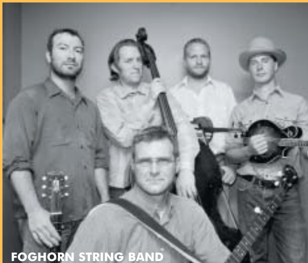
FOGHORN STRING BAND